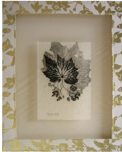
Begonia 6, 2009, 68 x 56 cm