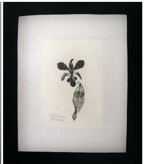
Dendrobium langblütig 8, 2009, 67 x 55 cm