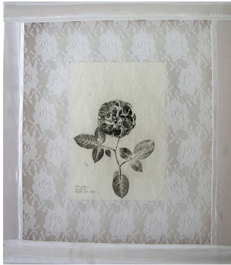
Rosa gallica 7, 2009 59 x 52 cm