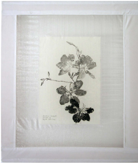
Bauhinia variegata 12, 2009, 76 x 62 cm