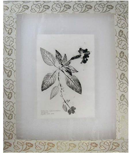
Crossandra 4, 2009, 63 x 53 cm