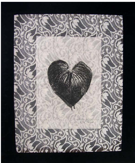
Anthurium "Heart" 6, 2008, 61 x 51 cm