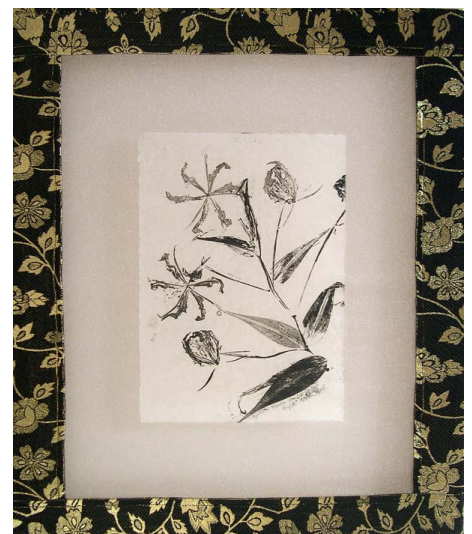
Gloriosa superba 22, 2008, 66 x 55 cm