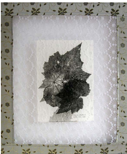
Begonia 8, 2009, 66 x 54 cm