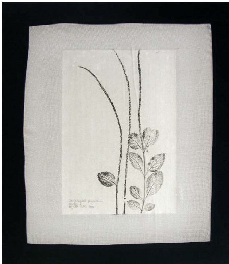
Stachytarpheta 3, 2009, 56 x 50 cm