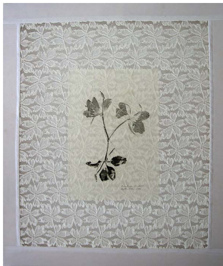
Hedychium 4, 2009, 68 x 60 cm