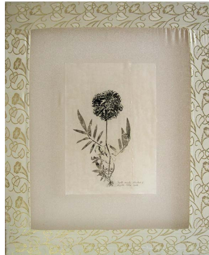
Tagetes erecta 2, 2009, 64 x 54 cm