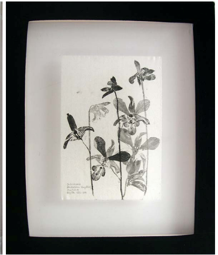
Orchidaceae lang 10, 2009, 60 x 50 cm