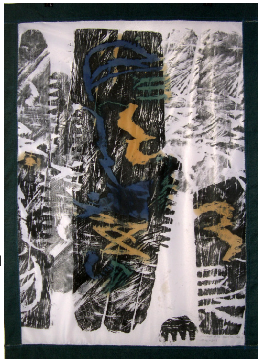
Bamberger Buche V-9, 2008, size 141 x 108 cm, bark print on canvas, 59 000 Rs (left side)

2 Wall hangings, which can be mounted on stretchers or get framed.