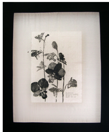
Orchidaceae groß 13, 2009, 65 x 55 cm