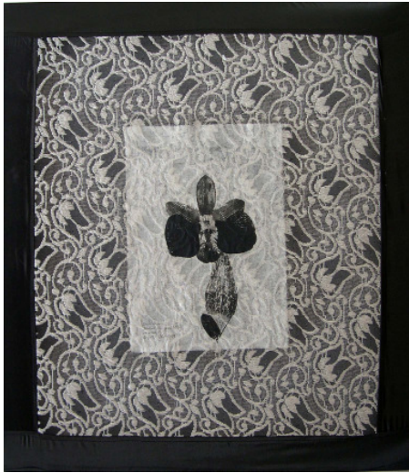
Orchidaceae groß 11, 2009, 69 x 62 cm